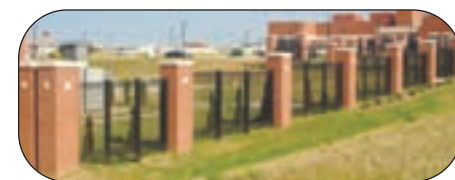
Shown above is another stretch of the fenceline. Unseen are the massive footers which anchor the fence. These were backfilled with dirt and are not visible.

For more information on Hercules Fence, write to 8194 Euclid Ct., Manassas Park, Va. 20111, or call 703-551-2609 or fax 703-361-2127.